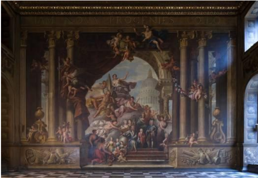
The West Wall of the Painted Hall, at the Old Royal Naval College, one of the UK's most important architectural interiors.

The Heritage Lottery Fund (HLF) has awarded a development grant of £29,000* to the Old Royal Naval College Greenwich for the first phase of the conservation of the Painted Hall, one of the UK's most important architectural interiors. The money means that plans for a full HLF grant application of £364,000 for the scheme can now go ahead.